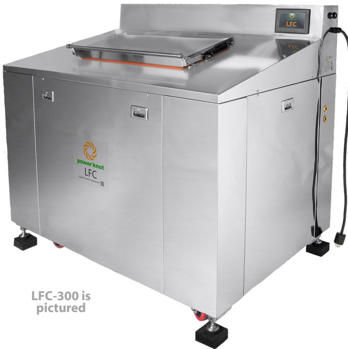
LFC-300 is pictured